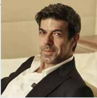
INTERNATIONAL JURY PIERFRANCESCO FAVINO Actor

The most prominent Italian actor of his generation, Pierfrancesco Favino has gained recognition with Gabriele Muccino's debut hit The Last Kiss (2001). Awarded for his performance in Michele Placido's Romanzo Criminale (2005), he pursued a parallel career in Hollywood with Ron Howard's Angels and Demons and Rush , Spike Lee's Miracle at St. Anna and Marc Foster's World War Z . In 2018, he played the role of Tommaso Buscetta in Marco Bellocchio's The Traitor , presented in Competition at the Festival de Cannes 2019, and returns in 2022 with Mario Martone's Nostalgia , also in Competition. In between, he shoots Hammamet by Gianni Amelio and Padre nostro by Claudio Noce (2020), for which he wins the Best Actor prize at the Venice Film Festival. He recently worked with Pablo Larrain on Maria and Gabriele Salvatores on Naples to New York .